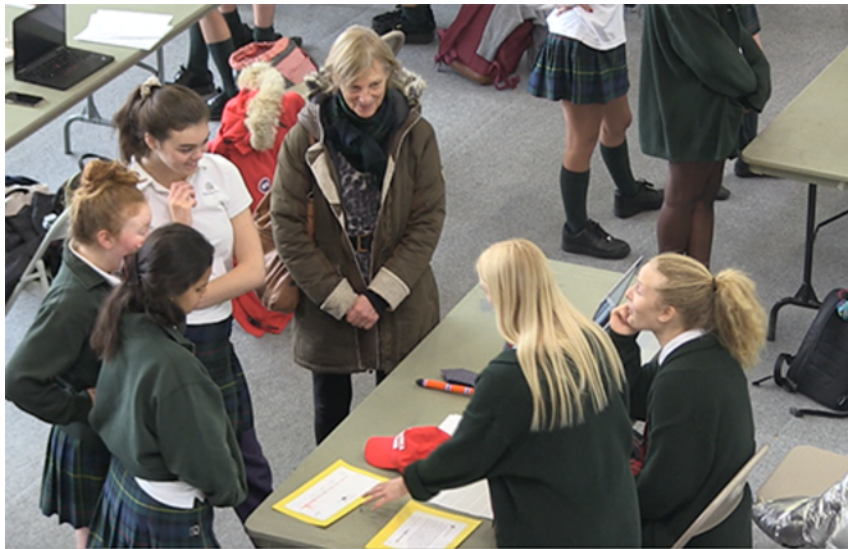
An example of a TOK exhibition event