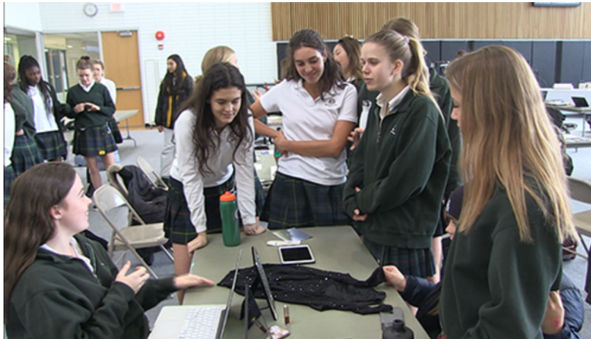
An example of a TOK exhibition event